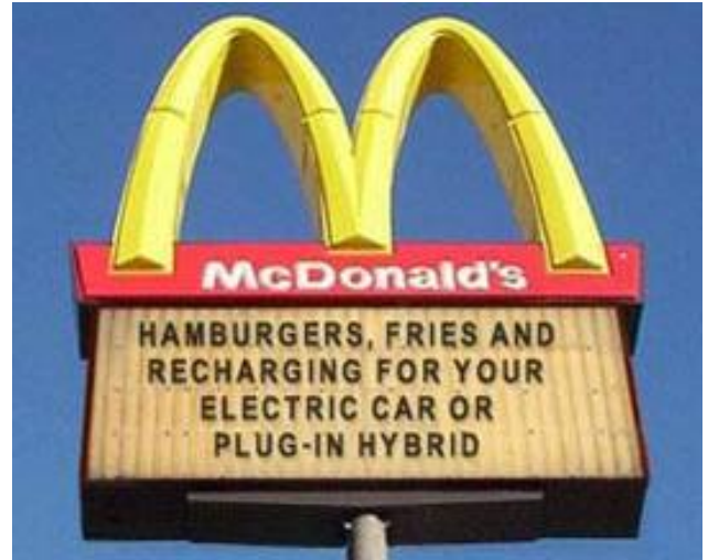
McDonald's in Cary, NC