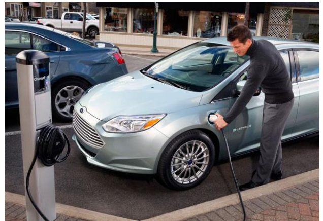
Chevy Volt (top) and Ford Focus (bottom)