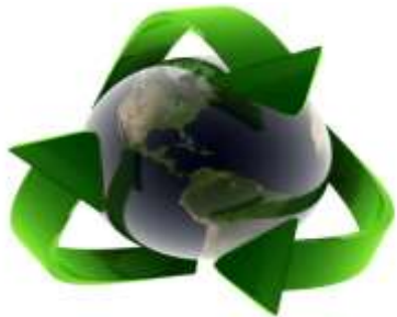
Support development of clean economy industries