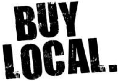
Buy local campaigns