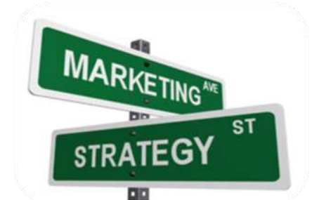
Sustainable economic development strategy