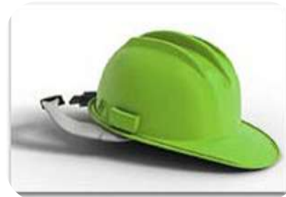
Sustainable workforce development