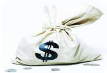
Sustainable business recognition program