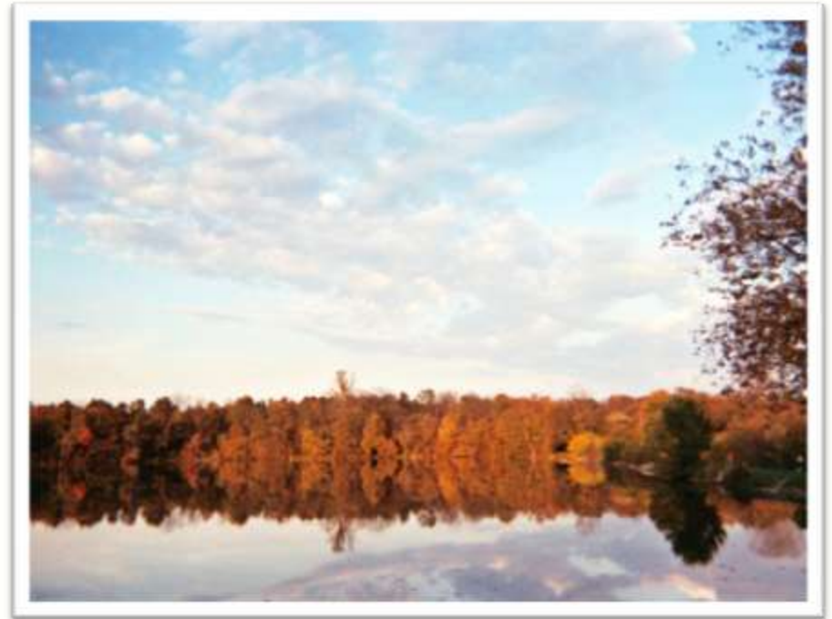
High School Student Photographer