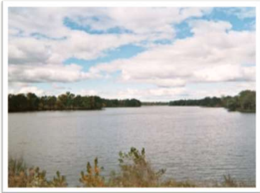
Middle School Student Photographer